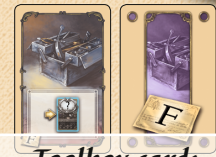
Toolbox card: front and back

Setup: The Module cards and base cards are shuffled together as usual. The Toolbox card ( from now on, referred to as 'toolbox' ) has to be placed next to the 3 piles with Action cards.